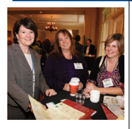
Pre-Event Activities 5:45 PM-7:30 PM Get Acquainted Reception